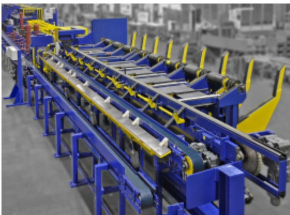
Automatic, manless working separation system for tubes in front of a pointing machine and in line with a drawing and straightening line