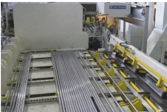
Automatic, manless working separation system for bars in front of a 2-roll-straightening machine