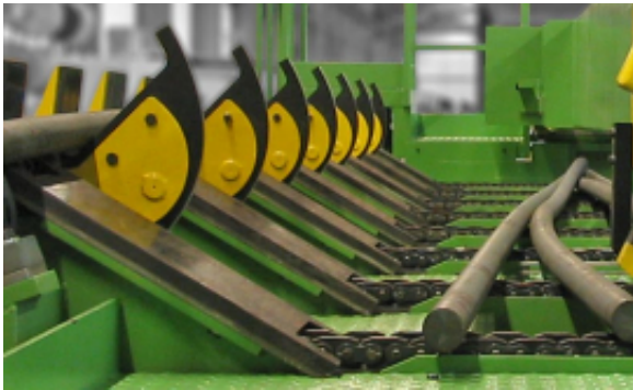
Automatic, manless working separation system for hot-rolled bars in front of a straightening machine